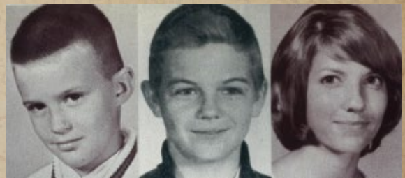
BROOMSTICK MURDER VICTIMS